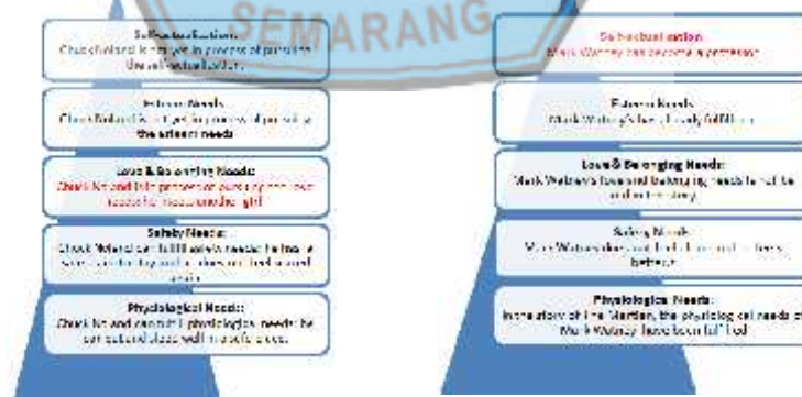
Diagram 3. Hierarchy of Needs Diagram of Chuck Noland (left) and Mark Watney (right) after being saved from isolation

After Chuck Noland and Mark Watney are saved from isolated place, they back to normal life. In this place the level of hierarchy of needs between Chuck Noland and Mark Watney can be seen in the diagram below.