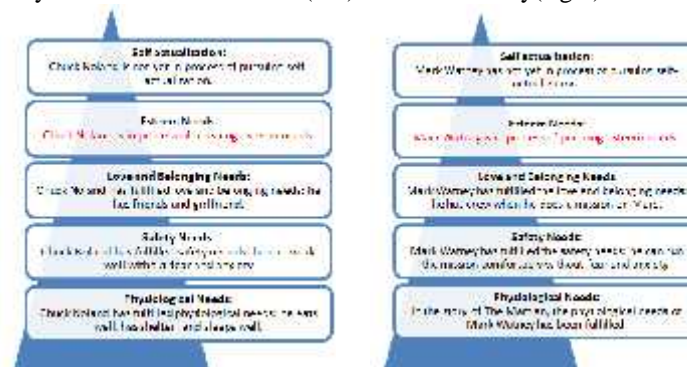
Diagram 1. Hierarchy of Needs of Chuck Nolan (left) and Mark Watney (right) and before Isolated

Before Chuck Nolan and Mark Watney get accident, they have similar level of hierarchy of needs. They have already reached into esteem need level. It can be seen in diagram below.