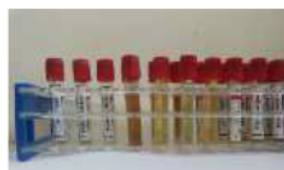
Figure 3. Infusion Making Processes