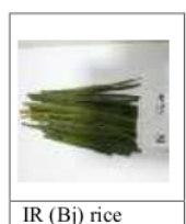
Figure 1. Varieties of paddy leaves