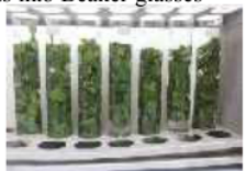
Figure 2. Simplicia of Vegetable materials.

Clean the materials. Separate each part of the materials. Slightly slice them as shown in figure 2. Finally, put those simplicia collected based on their parts into Beaker glasses