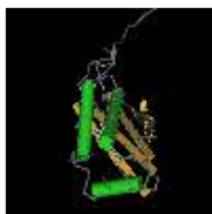
Figure 8. Hypothetic structure of MoaC c100242 superfamily which members include MoaC and MoaA proteins (Source: Protein Data Bank, PDB).

Figure 7. Predicted amplified DNA sequence on Pseudomonas spp. genome (lane 53) using JMF-JMR primers converted to protein sequence, which shared highest similarity with moaC of Pseudomonas stutzeri DSM 4166