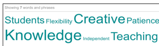
Figure 1. Textual analysis of Question 1.