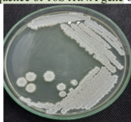
Figure 4. Colony morphology of HSFI-5 isolate

Part of bacterial identification was determining bacterial morphologic characteristics. The morphological characteristics of colonies and cells of bacterial isolate HSFI-5 are described in Figure 2 and Table 4. Based on Figure 2 and Table 4, colonies and cells of HSFI-5 are uniform showing colony purity of the bacterium. Next molecular identification on HSFI-5 isolate could be conducted based on DNA sequence of 16S rRNA gene of the bacterium [31].