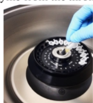
Figure 2. Centrifugation of bacterial culture in skim milk broth to obtain supernatant considered as crude protease

In this study, crude fibrinolytic protease from bacteria was tested for its thrombolysis activity. The crude enzyme was isolated by centrifuging the bacterial culture in broth media to obtain supernatant. The supernatant containing crude enzyme could be then tested for its activity in lysing blood clots in vitro by gravimetry method as previously reported [30]. Figure 2 and 3 showed centrifugation step and the obtained crude enzyme from the thrombolysis test, respectively, based on gravimetric method.