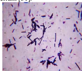
Figure 5. Cell morphology of isolate HSFI-5