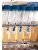
Figure 3. Crude protease from HSF1-3, -4, -5, and -6 isolates obtained after centrifugation

Results of thrombolytic activity screening test conducted on crude proteases of HSF1-3 to -6 against fresh blood clot using Gravimetric method were displayed in Table 2.