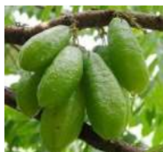
Figure 1. Bilimbi fruits ( Averrhoa bilimbi )

Fruits of bilimbi Figure 1 (green, not overly ripe) were freshly picked from a home garden in Kedung-mundu, Semarang, Indonesia. The fruits were washed with water to remove all unwanted materials and then rinsed with sterilized distilled water, then dried under sunlight for two days. The dried bilimbi were then 24 led into fine powder using a milling machine and stored in a sterile airtight container until further use.