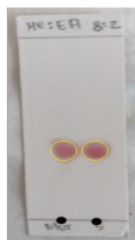
Figure 1. TLC analysis of MCE5 (left) against \beta -sitosterol standard (right). Both showed similar Rf values.