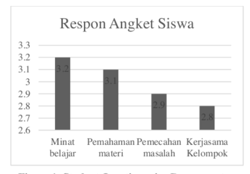
Figure 1. Student Questionnaire Responses to the Use of 3D Simulation Media

Student Response Data Analysis was carried out by researchers to find out how students responded to the use of 3D simulation media in the online learning process of molecular geometry material that had been carried out. There are four aspects that are analyzed, namely, aspects of student interest in participating in learning, understanding the material, ease of problem solving, and group cooperation. Based on the interpretation of the data in table 4, it is known that aspects of students' interest in following learning and aspects of understanding the material have very good criteria. As for the aspects of ease of problem solving and group cooperation, it has good criteria.