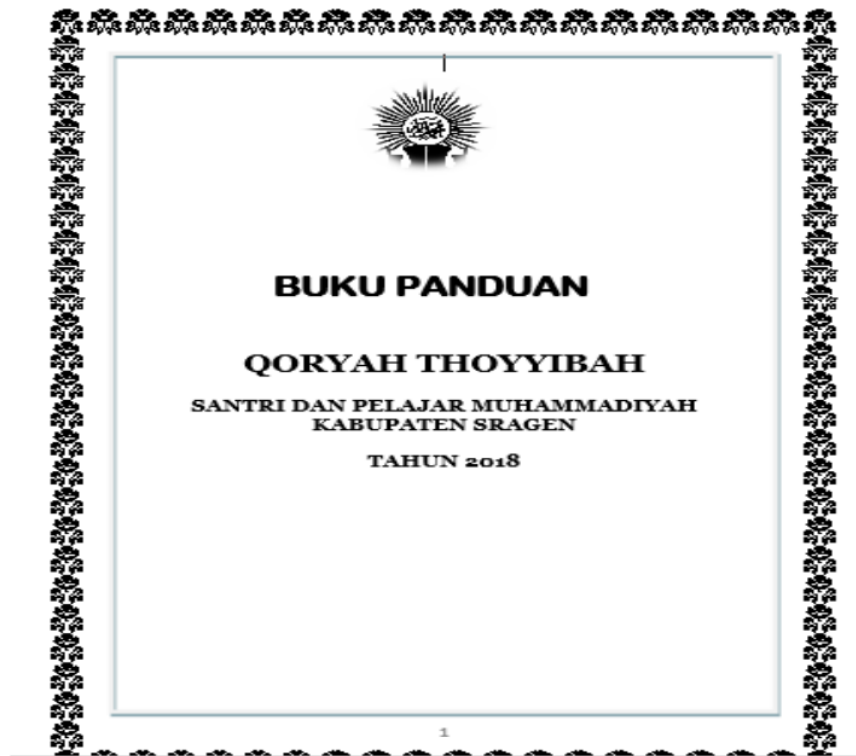
Figure 2 The cover of the qaryah thayyibah guidebook

Figure 2 is the cover of the guidebook of the qaryah thayyibah dawah method at the Pesantren in Sragen Regency. Contains the implementation of this qaryah thayyibah activity.