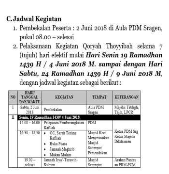
Figure 4.Schedule of qaryah thayyibah dawah activities

Figure 3 contains the implementation of the qaryah thayyibah activity, which consists of caravans (groups); it can be read from which elements of the group will be deployed in this qaryah thayyibah program, namely elements of SMA/SMK Muhammadiyah in Sragen Regency and from elements of Pesantrens/dimsa/treinsein. From Figure 3, it can be read about the location of the students and grade 3 students of SMA/SMK Muhammadiyah in Sragen Regency who will take part in the Qaryah Thayyibah Dawah, namely there are three sub-districts of Kedawung, Sambirejo, and Karangmalang of Sragen Regency.