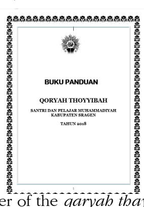
Figure 2. The cover of the qaryah thayyibah guidebook