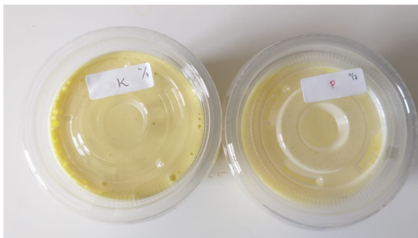
Figure 2 The representative ice cream consumed by the control group (left) and intervention group (right). The physical appearance of ice cream in the control and intervention groups was identical.