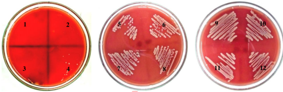
Figure 2. MBC value of P. flabellatus against MRSA: 1. 1000 mg/mL, 2. 500 mg/mL, 3. 250 mg/mL, 4. 125 mg/mL, 5. 62.5 mg/mL, 6. 31.2 mg/mL, 7. 15.6 mg/mL, 8. 7.81 mg/mL, 9. 3.91 mg/mL, 10. 1.95 mg/mL, 11. 0.98 mg/mL, 12. 0.49 mg/mL