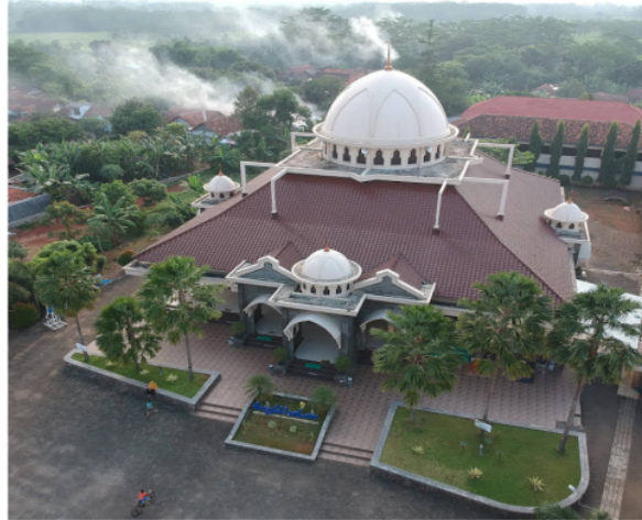
Figure 2. Photo of the Al-Khuzaemah Mosque From Above