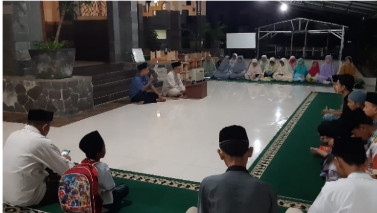
Figure 3. Pengajian Malam Ahad (Sunday Night Study)

The study circles (pengajian) organized by Masjid Al-Khuzaimah closely resemble the characteristics of a social movement phenomenon. Some regularly scheduled study circles include the Sunday Night Study (Figure 3), 17th of the Month Study, and Morning Spirit Study. Of particular note is the Morning Spirit Study, which exemplifies a collaborative effort with Muhammadiyah Vocational School in Kajen. This initiative involves students, teachers, staff, and even members of the mosque's surrounding community. This collaborative nature of the activities underscores their role in fostering a sense of community and cooperation.